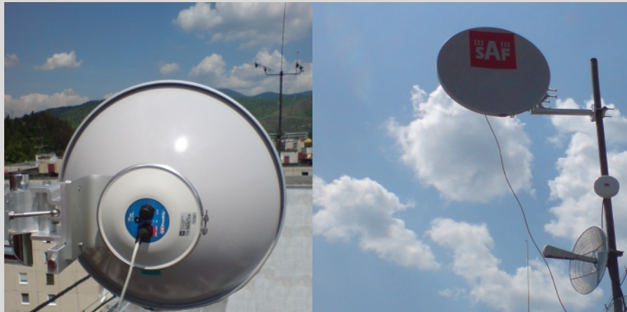
SAF FreeMile all outdoor system