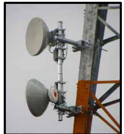
Mt Canobolas Repeater Site