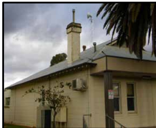
Cudal Office Site

As a result of the upgrade project, data speed of Cabonne Shire Council's WAN has increased from just 2Mbps to 200+ Mbps full-duplex, whilst decreasing end-to-end network latency from 100ms to under 1ms. The result has enabled Council staff to work far more effectively and efficiently than they were able to do so in the past.